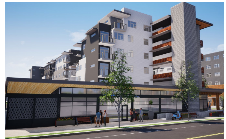
Grow Market – Gateway South